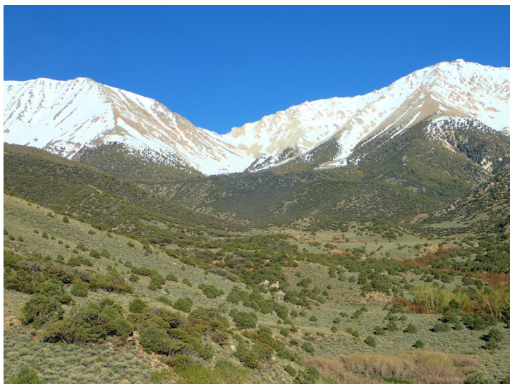
The Jumpoff and Montgomery Peak.

downhill to a good camp spot right at the stream at approximately 8,300+'. Approximately three quarters of a mile back is another pullout near the stream, good for several vehicles at about 8,100'. Do not attempt to drive a standard clearance vehicle on this road, and I recommend good AT tires for your HC vehicle due to the many rocky sections which must be crossed.