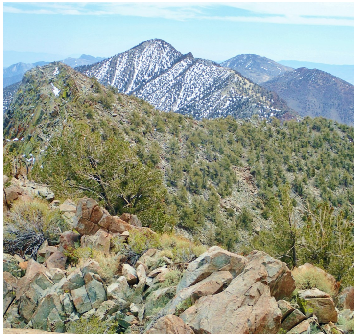
Keynot Peak from Mount Inyo, showing snow.

Unlike Inyo, most of the way to Keynot is over open country with good footing. Although steep in spots, it's nothing like the trip up to the ridge. Upon approaching Keynot I found significant amounts of snow on the northeast slopes that were hidden from view before (see the picture below).