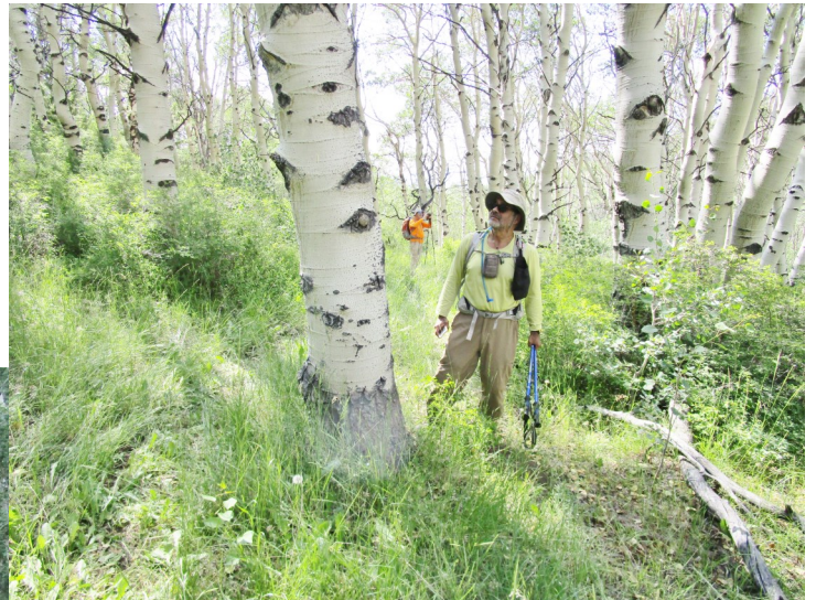
Jorge Estrada looking at a massive, old aspen tree that is bigger around than he is.

trees, some going back as far as the 1920's. Once out of the Aspens, the trail reaches a small ridge, with great views all around.