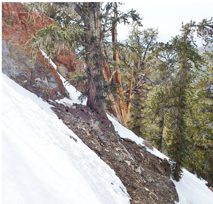
Snow on Keynot Peak.

lose my GPS unit in the brush up there while trying to find ways around the snow.