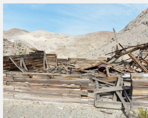
Miner's cabin built with old railroad ties.

With no map I had no idea where the summit of Little Cowhole was, so we ended up climbing two other bumps before finally arriving at the summit. As a result we fortuitously stumbled upon an interesting miner's cabin constructed of old railroad ties, probably taken from the nearby Tonopah and Tidewater rail road, which was built to replace the 20 mule teams hauling borax.