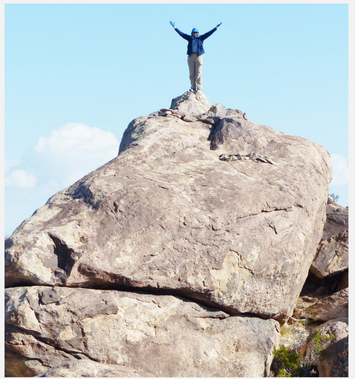
Debbie Bulger on the summit of Cave Mountain.

It was a delightful surprise. This straightforward scramble brought a big smile to our faces as we spotted a bighorn ram about halfway up the peak. We froze when we saw it and thus were able to observe it first watching us to try to