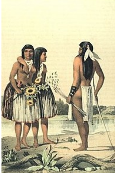
Yumas Indians: "United States and Mexican Boundary Survey. Report of William Emory..." Washington, 1857, Volume I.

Upon the receipt of a few gifts, the Quechans helped Anza, his men and their livestock to safely cross the Colorado. Indeed, a rapport of sorts was established between the groups. Unfortunately, Spain, in their usual insensitive quest for conquest and religious conversion, was not content to leave the tribe to its own devices.