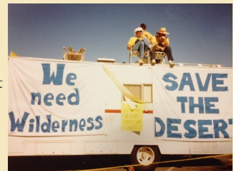
Desert Bill hearings, November 1989, Barstow CA. Almost 2,000 in attendance.